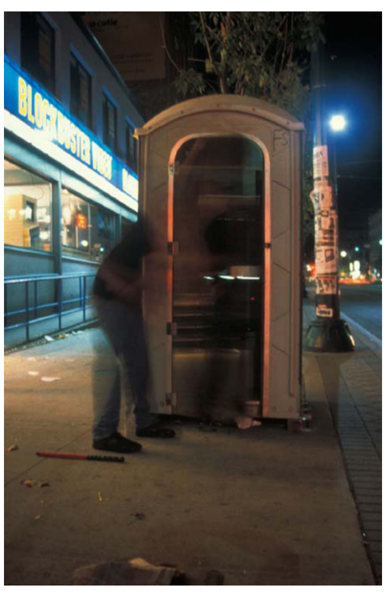
Public Water Closet, modified portable toilet, 2-way mirror glass (Ottawa and Toronto) 1998, photos: Adrian Blackwell.

between artist and audience, ruptures that draw us into contested social ground, where we discover our own freedom.