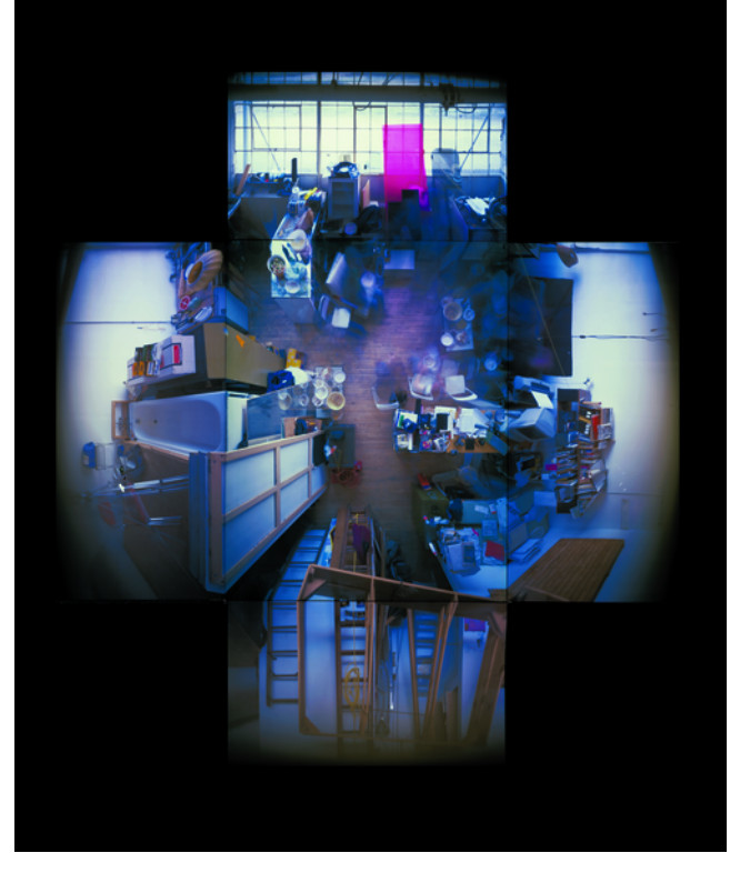
Evicted May 1, 2000 (9 Hanna Ave.), 13 colour pinhole photos, 20x24" and 24" x 30", 2001, photos: Adrian Blackwell. Photo 2 – Adrian Blackwell's Space